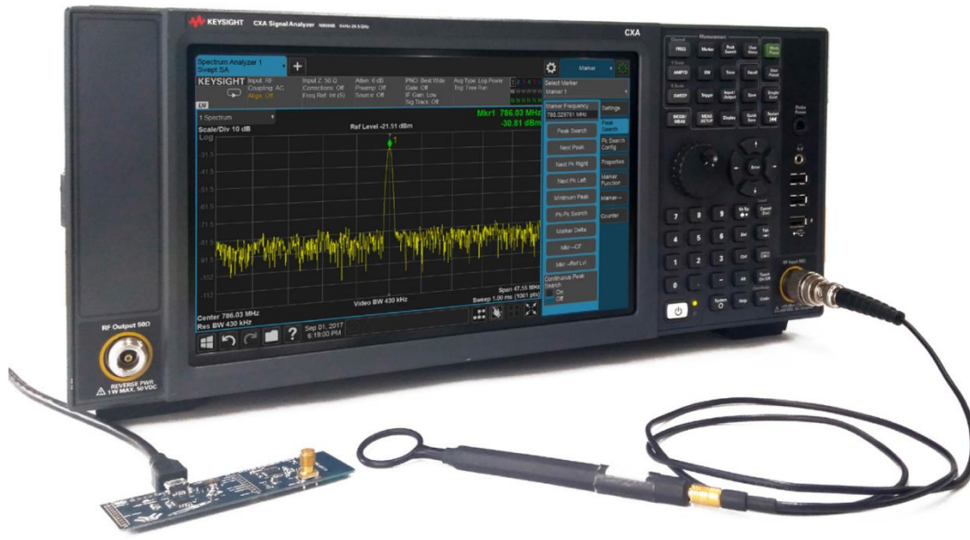
Figure 2: Near-field probe and CXA signal analyzer test the emission of PC LAN port during design cycle before full compliance testing